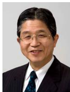
Prof. Akira Fujishima (Tokyo University of Science, Japan)